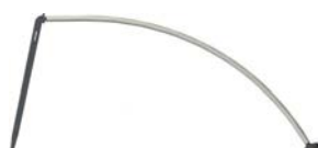
DRIPPER STAKE ASSEMBLY

XX denotes the length of the micro-tube in inches. YY denotes the flow in lph for the Dripper Stake Assembly. Substitute XX with the following available micro-tube lengths: 18", 24", 30" and 36". Example: DWST1-18