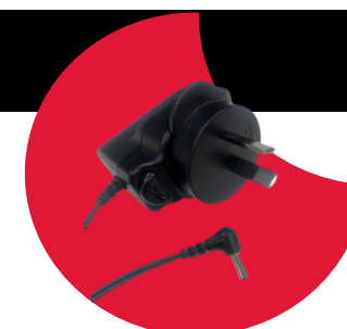
Power transformer 220-240V included