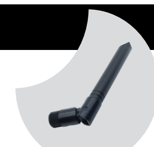
Swivel antenna (included)