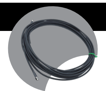
5 or 10 m cable extension (optional)